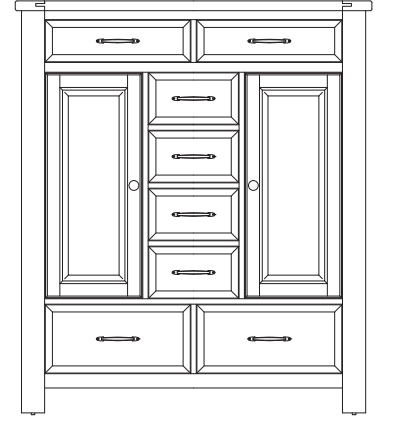
H. -116 Sweater Chest -8 Drawers/Two Doors