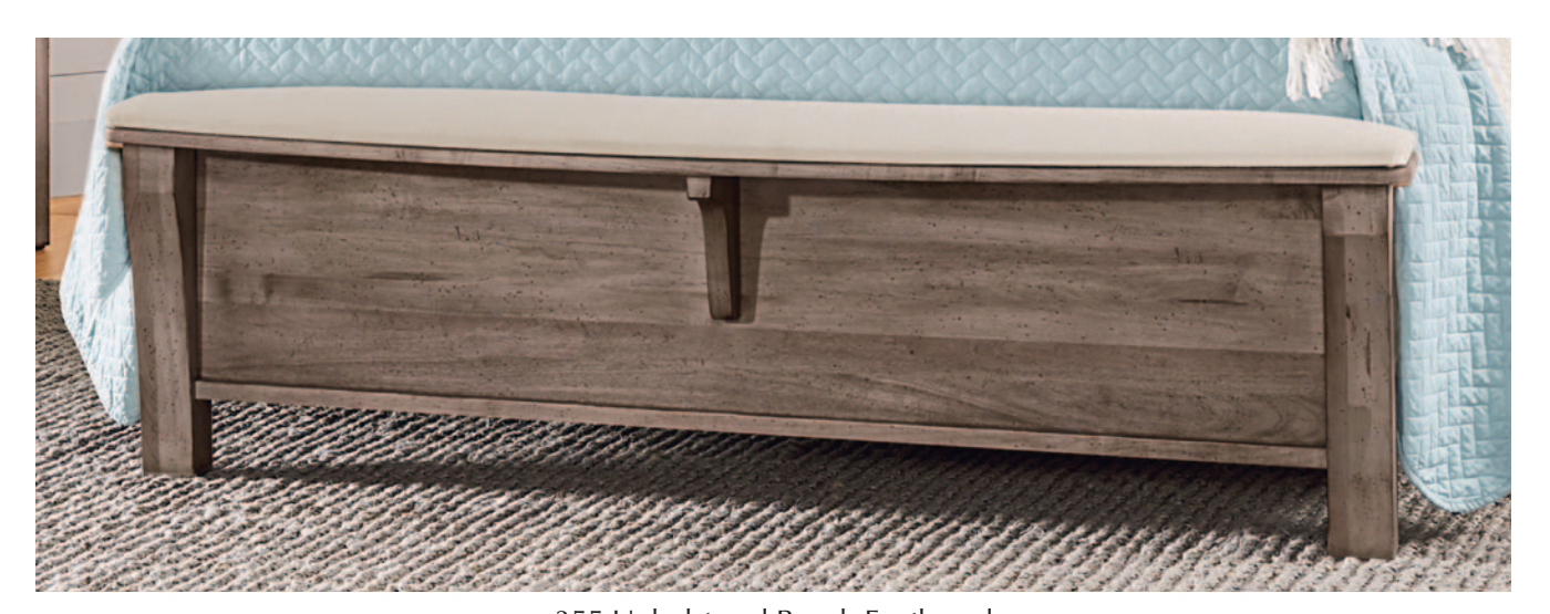
-355 Upholstered Bench Footboard