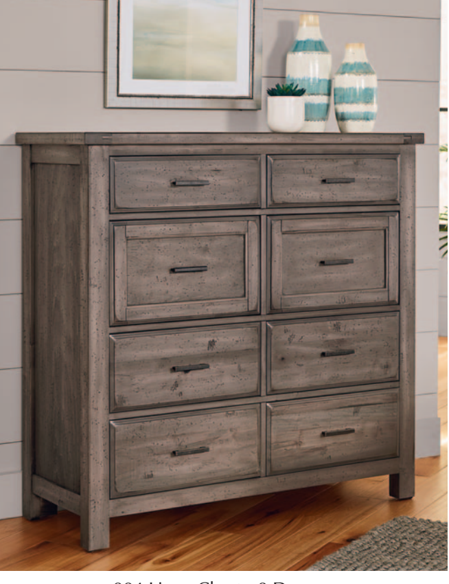
-004 Linen Chest - 8 Drawers